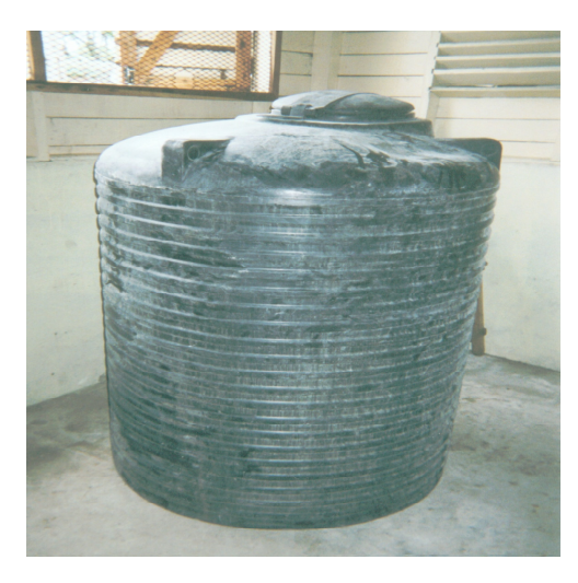
Figure 4. Polyethylene tank commonly used for water storage.

heater is used for the hot water source, it can be obtained from at least one plumbing/irrigation company in Georgetown who stocks these imported items.