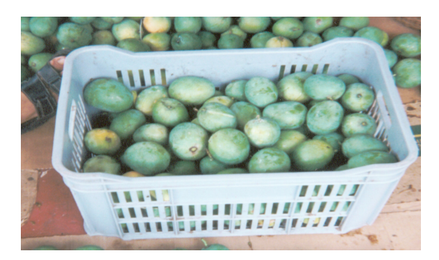
Figure 9. Rigid plastic container ideal for hot water treatment of mango fruit.