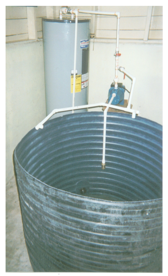
Figure 7. Front view (without water) of hot water treatment unit at the NGMC packinghouse. Note: plumbing of PVC pipe inside the tank is not completed.

A prototype of this inexpensive hot water treatment unit was constructed at the NGMC packinghouse in the Sophia Exhibition Center Complex (Figures 7 and 8). It is capable of treating approximately 90 kg (200 lb) of mangoes at one time. An ideal container to use for submerging the fruit is made of smooth, rigid plastic and is well ventilated (Figure 9). This type of unit can be constructed within a day. The cost and availability of all the components is indicated below. The cost of labor for the plumbing and electrical wiring is not included, since it will vary according to the individual site and technician capability.