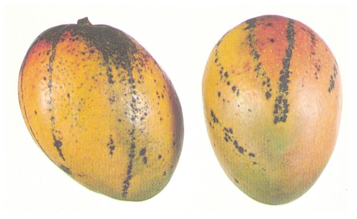
Figure 3. Tear-drop pattern of anthracnose development on mango fruit.

A tear-drop pattern of black spots running length-wise down the fruit is common due to dispersion of the fungal spores by raindrops (Figure. 3).