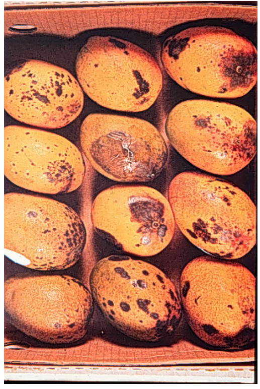
Figure 2. Large black anthracnose lesions on ripe mango fruit.