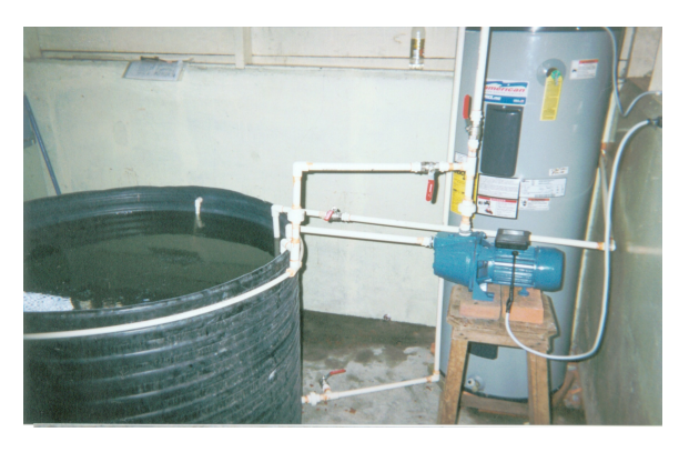
Figure 8. Side view (with water) of hot water treatment unit at the NGMC packinghouse.