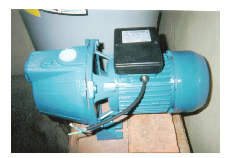
Figure 6. Water pump used for circulating water from the hot water heater to the tank.

The hot water must be circulated in the tank with a sufficiently high flow to ensure uniformity of temperature. Therefore, a water pump of adequate flow rate capacity and tolerance to at least 52^{\circ}C ( 126^{\circ}F ) water is needed. Several commercial hardware stores in Georgetown sell these types of water pumps (Figure 6). Additional accessories which will be needed to complete the hot water treatment unit include high-temperature resistant PVC pipe, shut-off valves, silicon sealant, and an in-line water filter.