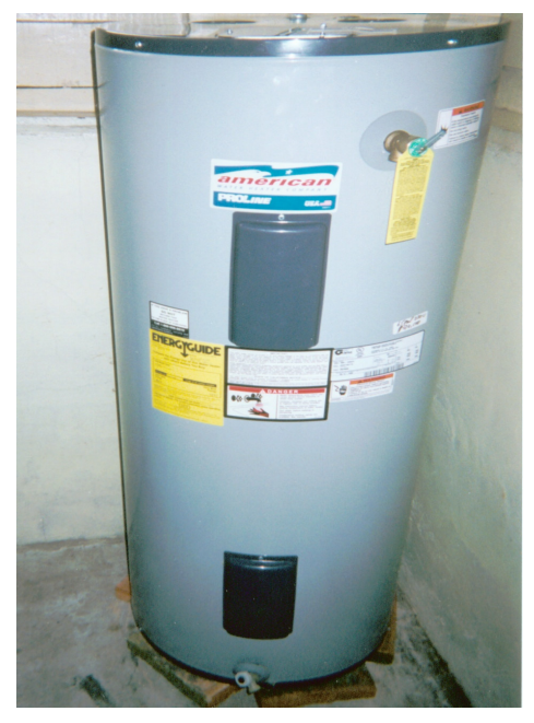
Figure 5. Commercial hot water heater used to heat the water tank.

The hot water must be circulated in the tank with a sufficiently high flow to ensure uniformity of temperature. Therefore, a water pump of adequate flow rate capacity and tolerance to at least 52^{\circ}C ( 126^{\circ}F ) water is needed. Several commercial hardware stores in Georgetown sell these types of water pumps (Figure 6). Additional accessories which will be needed to complete the hot water treatment unit include high-temperature resistant PVC pipe, shut-off valves, silicon sealant, and an in-line water filter.