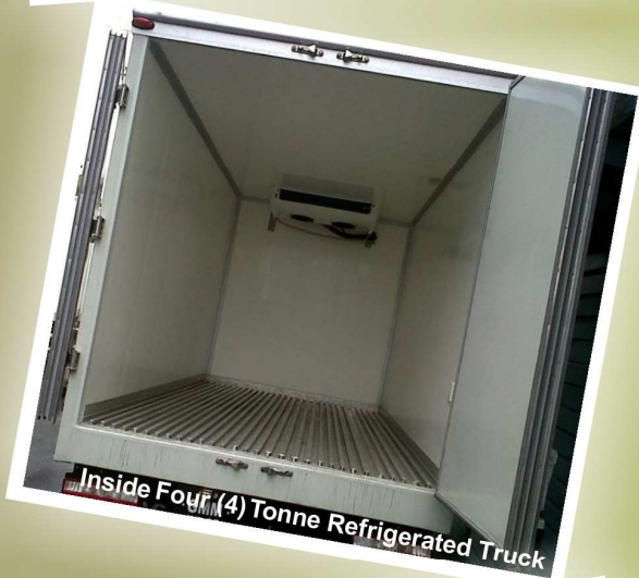
Inside Four (4) Tonne Refrigerated Truck