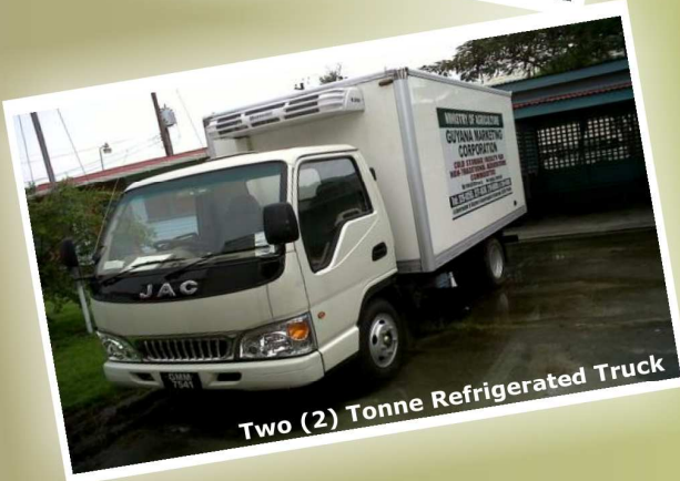
Two (2) Tonne Refrigerated Truck