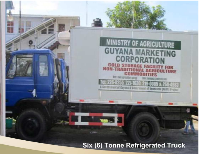
Six (6) Tonne Refrigerated Truck