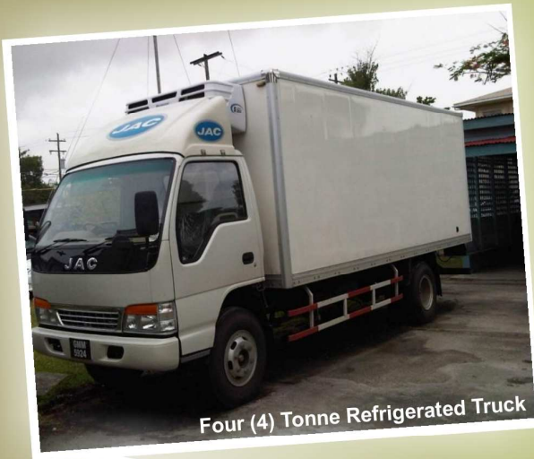
Four (4) Tonne Refrigerated Truck