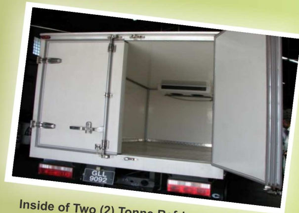
Inside of Two (2) Tonne Refrigerated Trucks