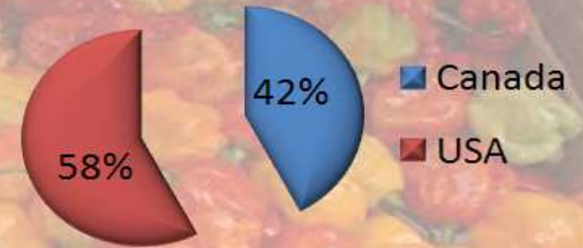
Major Importers of Hot Pepper 2012 (Jan-Aug)